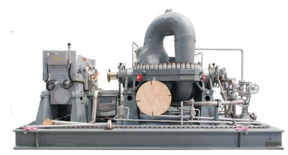
With 70 years in the industry, Ruhrpumpen is the ideal supplier to partner with, as our products were designed to fit in every stage of the pipeline process.

Oil and gas resources need to be transported over long distances from their point of extraction. From offshore platforms and onshore extraction fields, to refineries and storage tanks, and later to the final consumer, pipelines move hydrocarbons all around the globe.