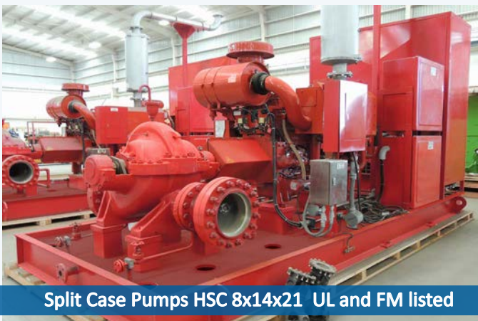
Split Case Pumps HSC 8x14x21 UL and FM listed

Engineering for the Petroleum & Process Industries (Enppi) has purchased new Fire Package Systems consisting of two split case pumps, model HSC 8x14x21, driven by a 382 HP diesel engine.