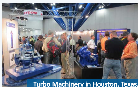
Turbo Machinery in Houston, Texas, US