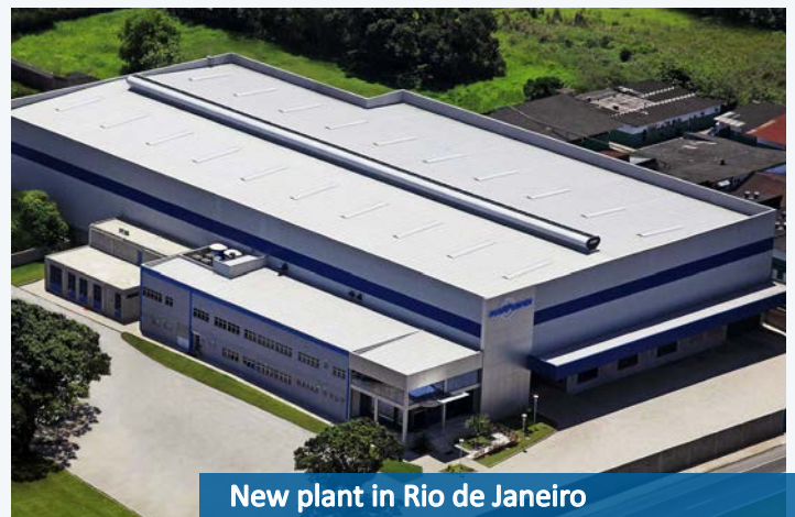
New plant in Rio de Janeiro

This new plant signals another keystone in the consolidation of our presence in the South American continent.