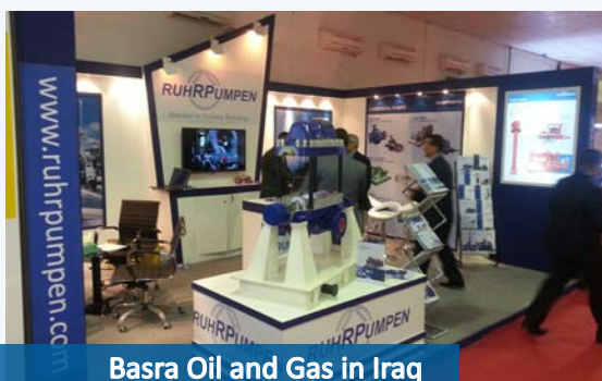
Basra Oil and Gas in Iraq

The company presented some of its key products for Oil & Gas, Water & Wastewater, and General Industry including OH2, SCE, Decoking System, Pitot Tube pump, Fire Pump Systems, and magnetic driven pumps, among others.