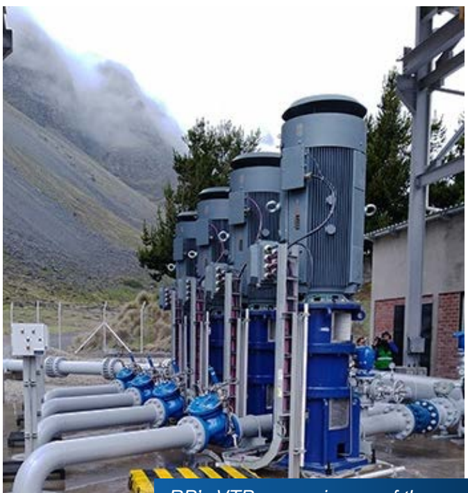
RP's VTP pumps in one of the pumping stations

Bolinter is a Bolivian engineering and construction company serving the oil & gas industry specialized in pipeline construction as well as compressor stations, gas plants and refineries and all terrain construction projects in Bolivia, which has been in service for over 40 years. Bolinter developed the civil works, mechanics, hydrostatic test, gammagraphy and restoration of impacted areas, as well as the selection and acquisition of all pipe materials and equipment for the 16" steel welded underground pipeline.