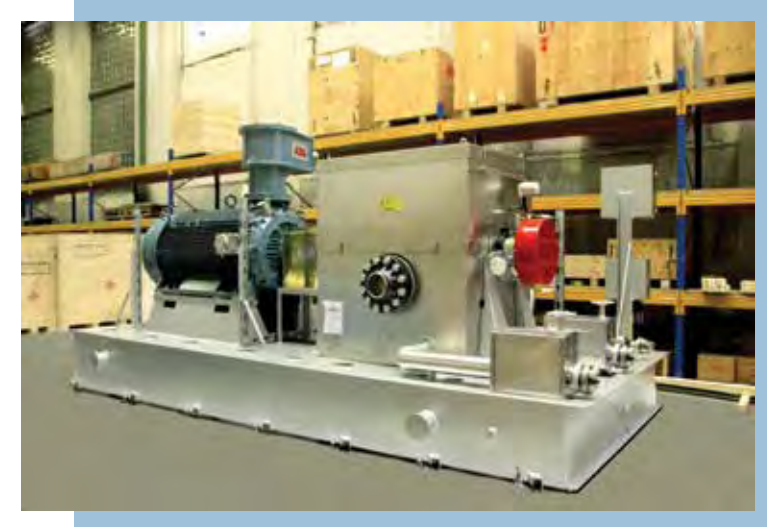
Pre-heated system arrangement or several types of steam Jacket options (photo) available.