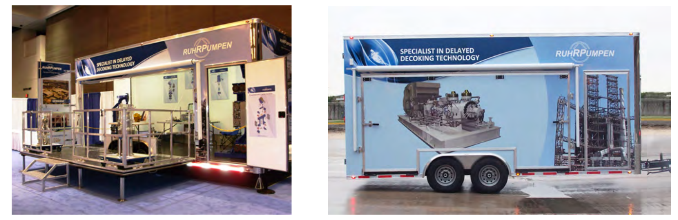
Decoking Display Trailer at the coking.com Coker Safety Seminar

As a result of this exhibition, Ruhrpumpen was invited to take the trailer on the road to give more presentations to its customers.