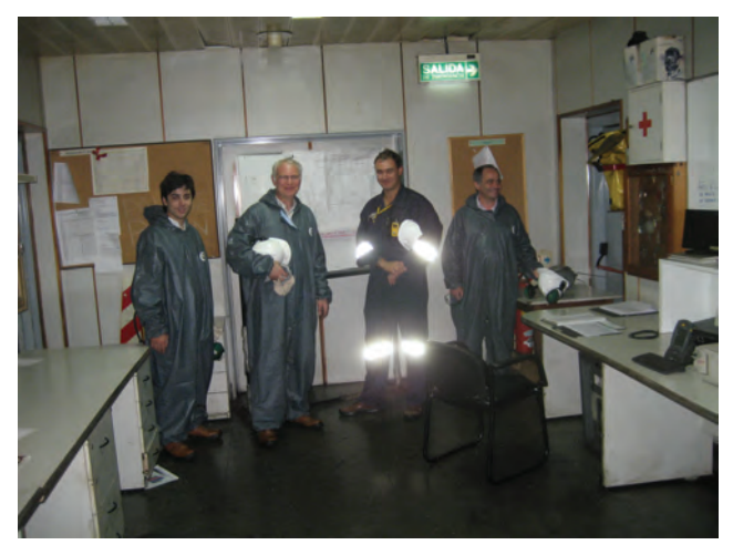
The Ruhrpumpen team ready to inspect the coker unit at Shell Argentina in April 2009.