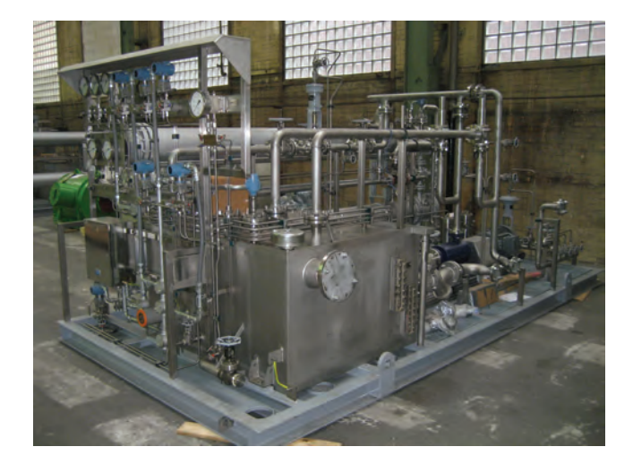
Jet Pump Unit and Lube Oil System, ready to pack and ship

Based on skillful order management and superior technology, other customers in India were convinced of the Ruhrpumpen advantage. Ruhrpumpen received the following orders in India from NOCL, MRPL, and IOCL-Paradip in 2009 and 2010.