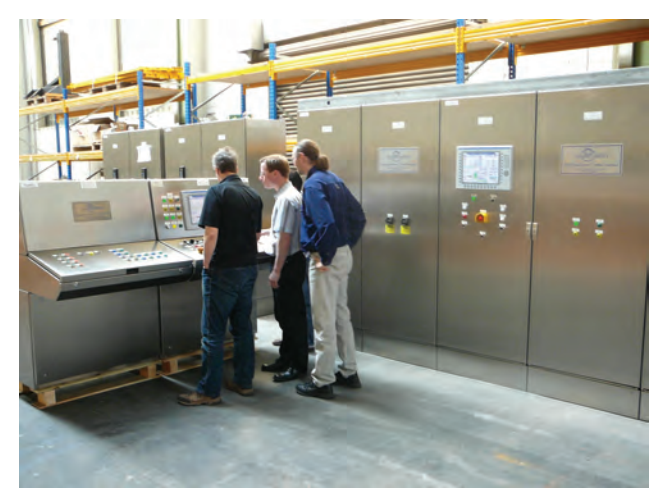
FAT of Control System for Hunt Refining

All mechanical and control equipment has been tested successfully, delivered, and will be installed later this year.