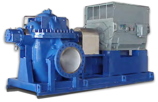
Horizontal Split Case Pump Single Stage - HSC