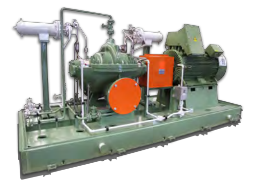
Horizontal Split Case Pump Single Stage - ZM

The Pipeline Company is one of four regional companies in charge of the pipeline operation management under Petro-China, Mr. Yao said. The Pipeline Company is running more than 3100km of crude oil pipeline and more than 5000km of product oil pipeline, transporting materials including crude oil, product oil, gas, etc. The Chinese long-transport pipeline industry gained rapid development in recent years, with over 6000km of new pipeline being constructed every year, most of which are being handled by the Pipeline Company.