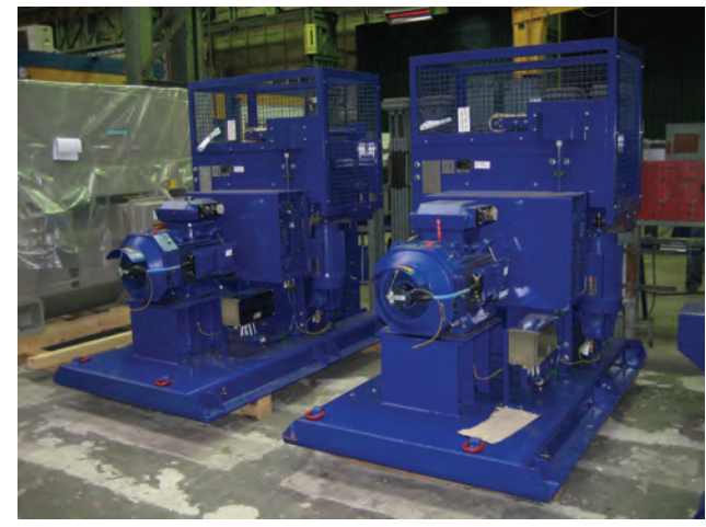
Hoist system for Hunt Refining

Ruhrpumpen BU worked closely with the North America-BU, the Project Management Team in Witten and Commonwealth. This included integrating the existing decoking unit with the new units with being provided by Ruhrpumpen.