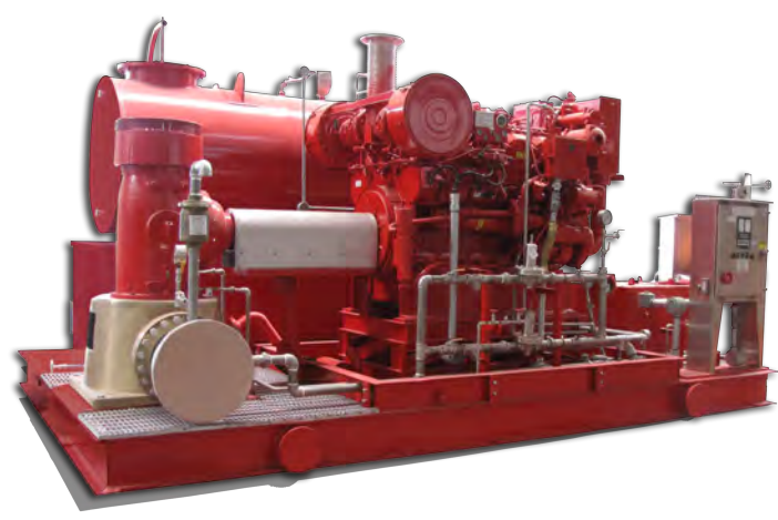
Pre-packaged Fire System for Chile, GNL

This new challenge demonstrates the growth of our company and commitment to satisfy market demand.