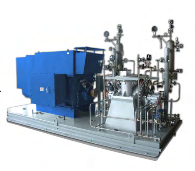
HVN - Between Bearing Double Suction Pump

Entering the renewable energy market is a significant step for Ruhrpumpen.