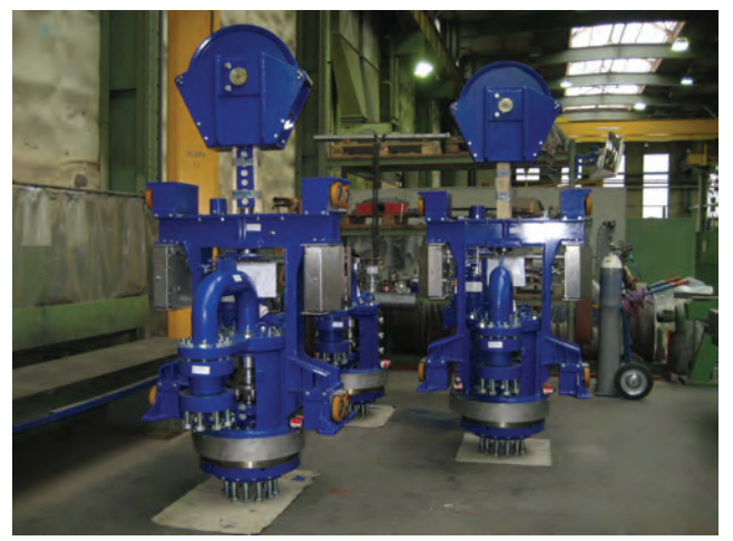
Two Crossheads with Drill Stem drives ready for packing and shipping to Argentina in March 2010.