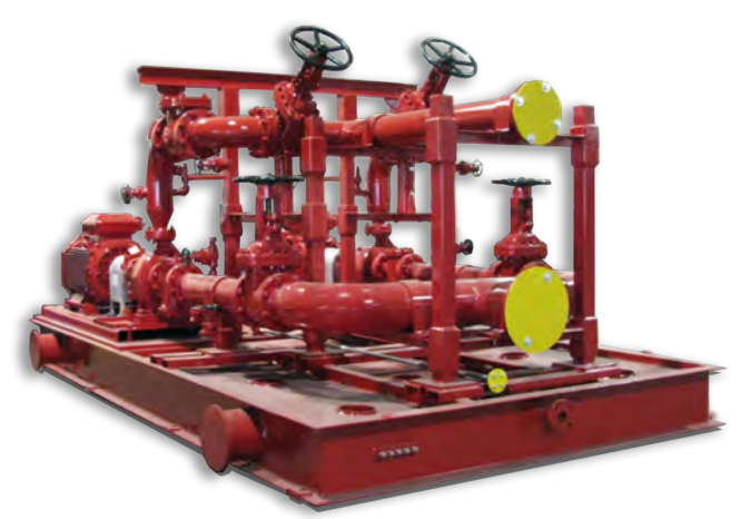
Pre-packaged Fire System for Argentina, Mining