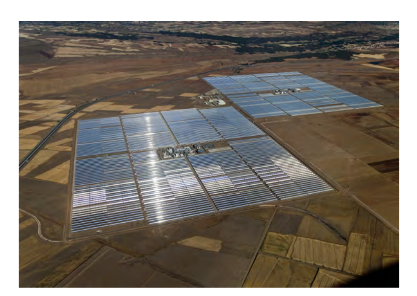
ANDASOL III - Solar Thermal Power Plant